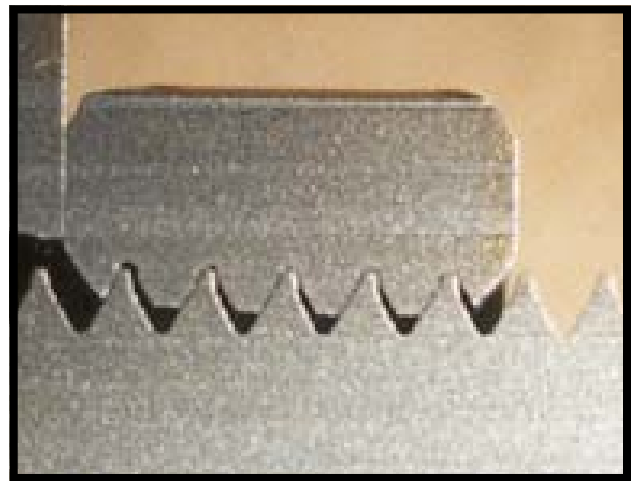
Spring action of the Dual-Angle™ Thread Profile